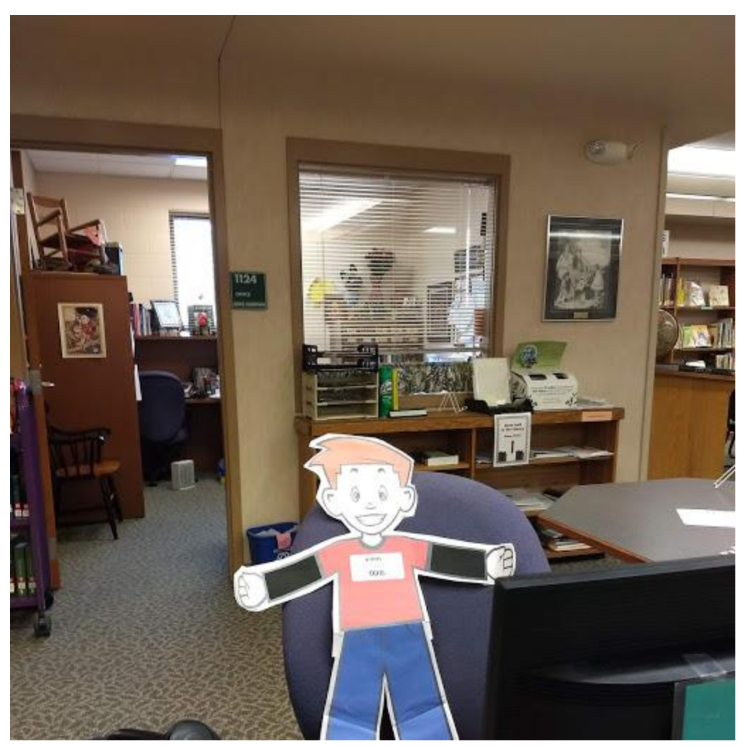
Well, well... look who showed up at the Dakota College Library Circulation desk today. We are happy to see you, Odie!