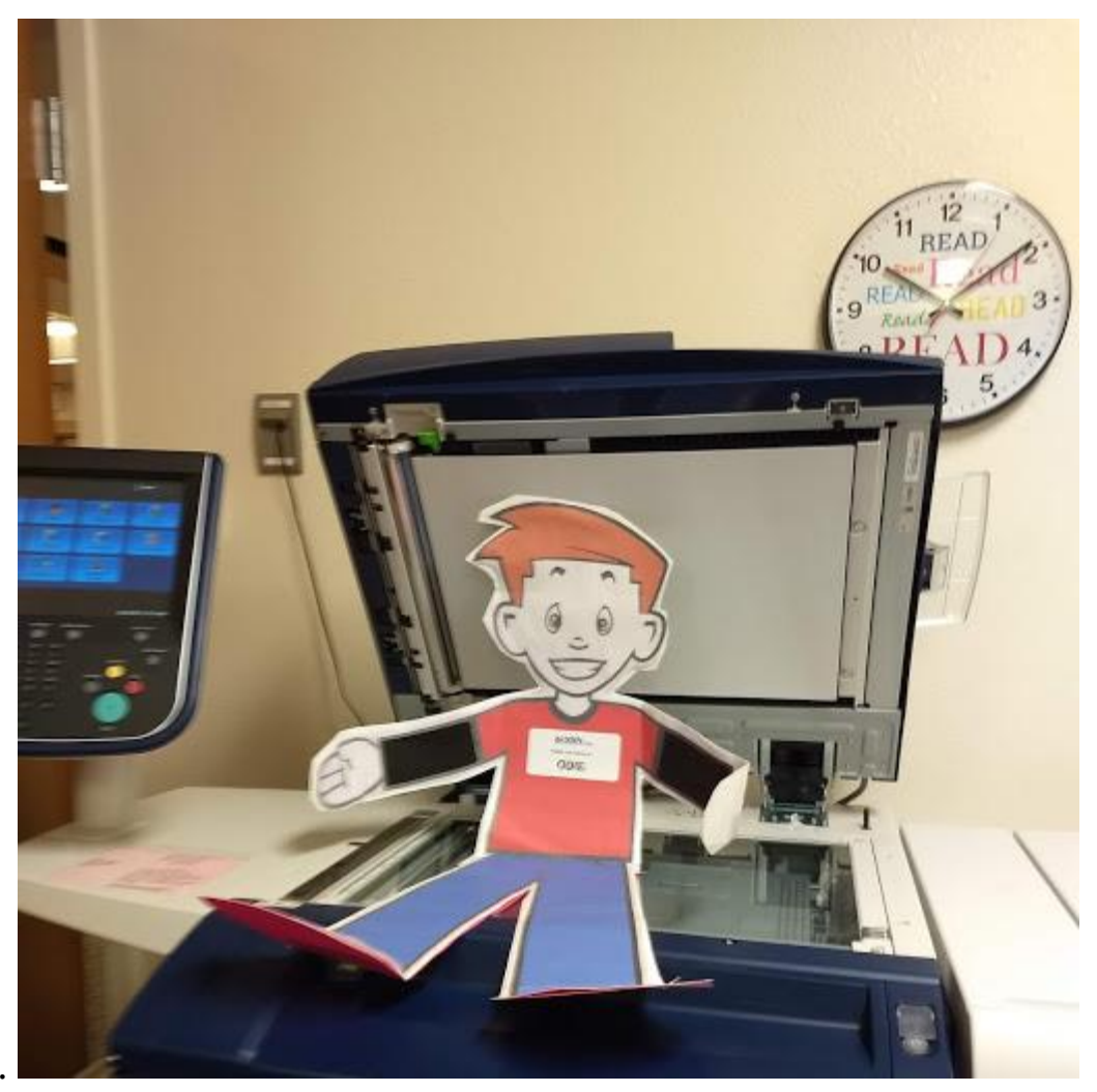
Okay, Odie. That is not exactly appropriate use of the copy machine.