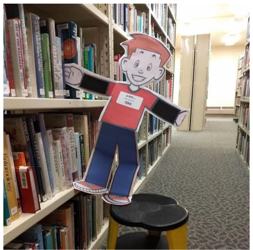
Odie wasted no time and immediately started to explore the stacks. Be careful on that stool, Odie!