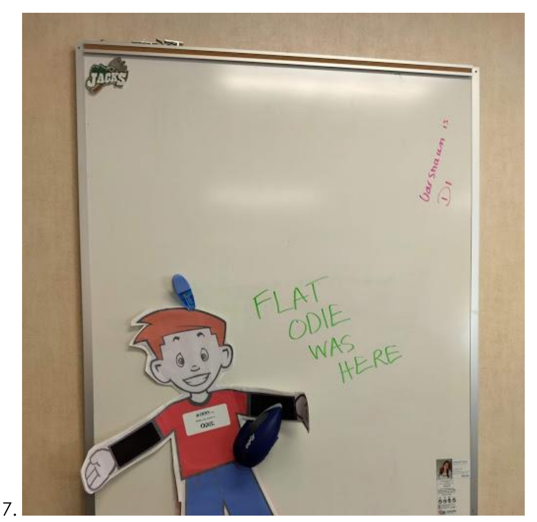
Next stop was the Student Success Center where Odie left his mark on the whiteboard.