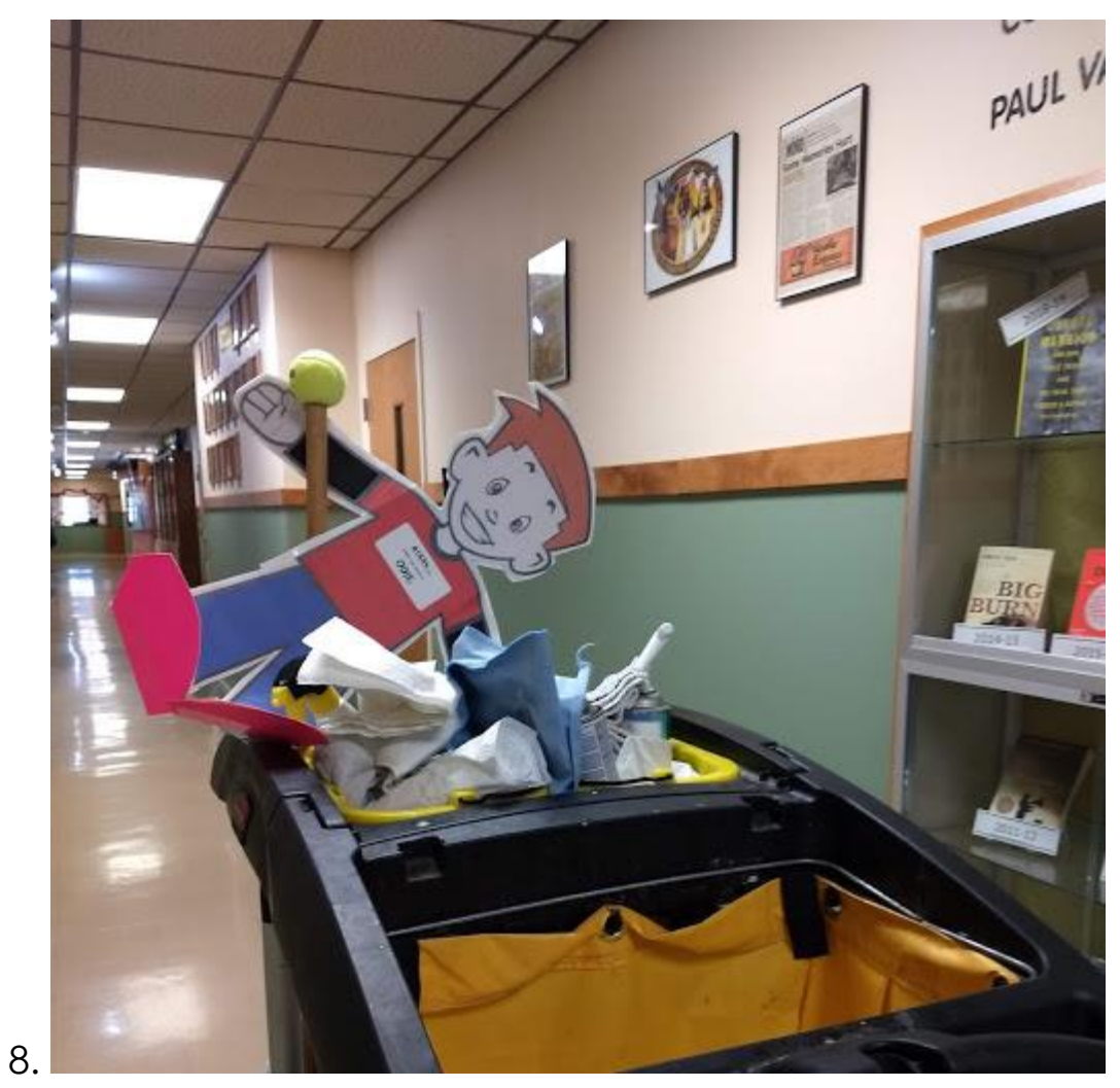
Whoa! Come back here, Odie!