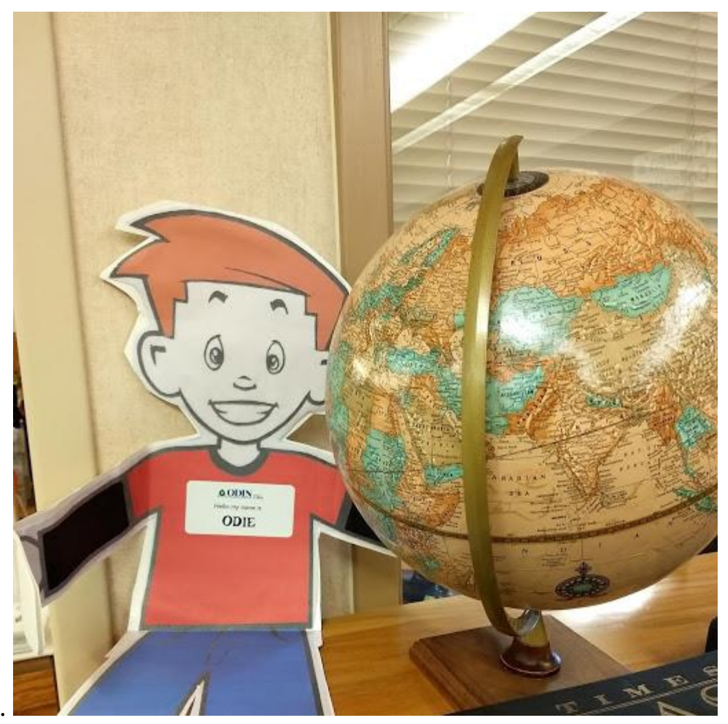
We sure loved having you here with us at Dakota College, Odie. Where in the world will Odie next appear?