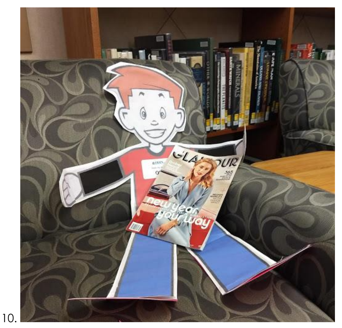
Odie is finally running out of steam. He picked out some light reading and settled into a comfy chair.